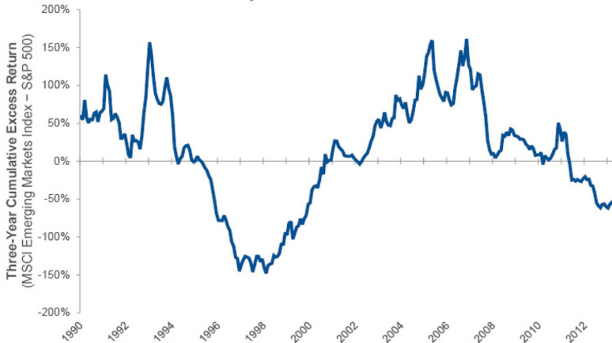
Figure 1. Emerging Market vs. U.S. Equity Returns, January 1988–March 2014